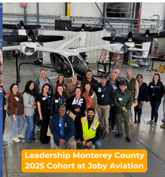
Leadership Monterey County 2025 Cohort at Joby Aviation