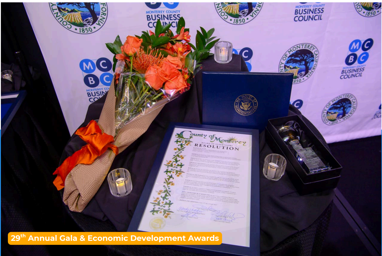
29 th Annual Gala & Economic Development Awards