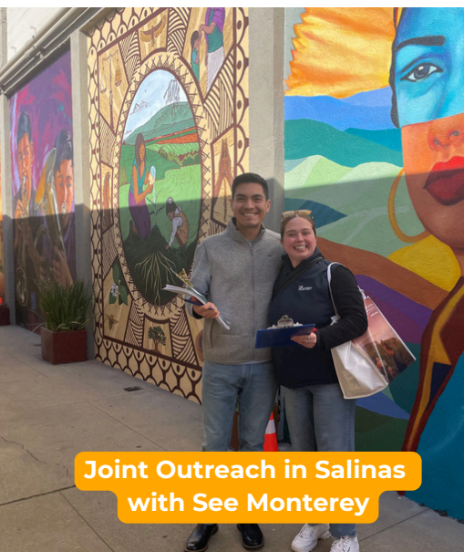
Joint Outreach in Salinas with See Monterey