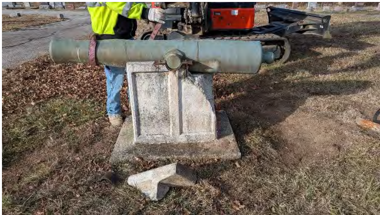
Old cannon while crew was making repairs