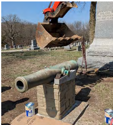
Cannon being set on new base